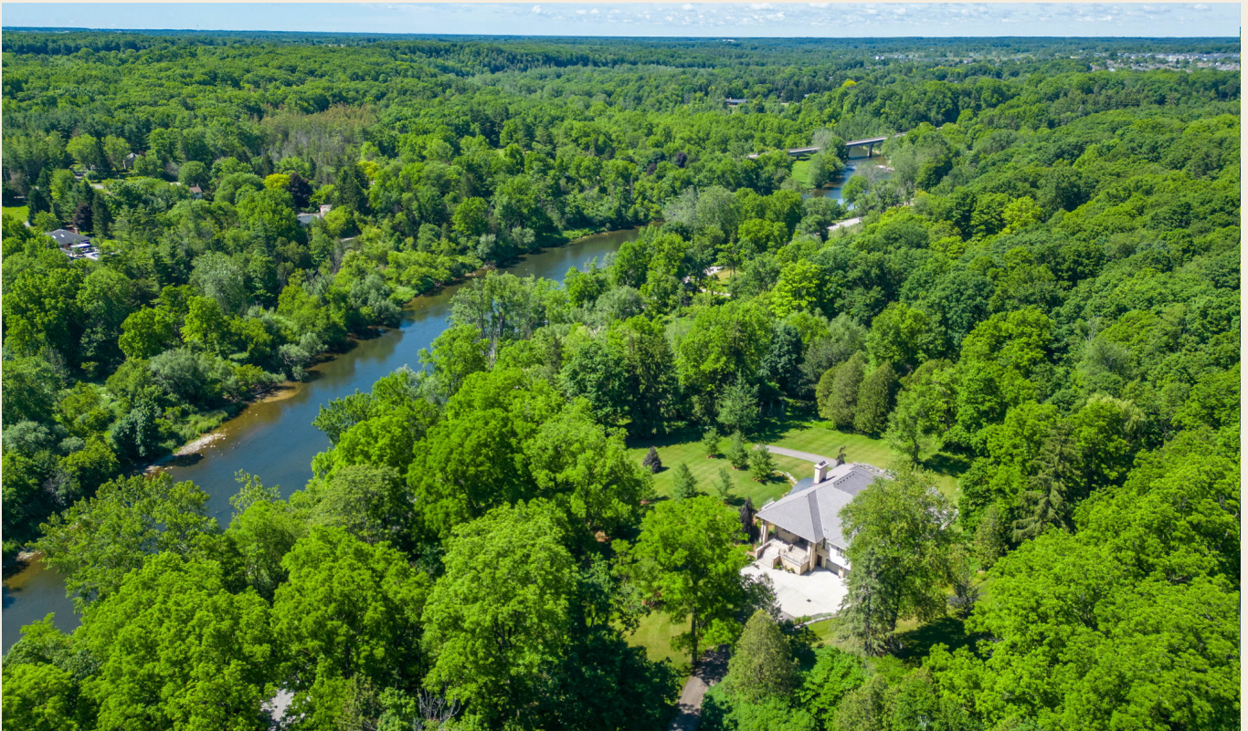
— The estate, set in its clearing above the river.