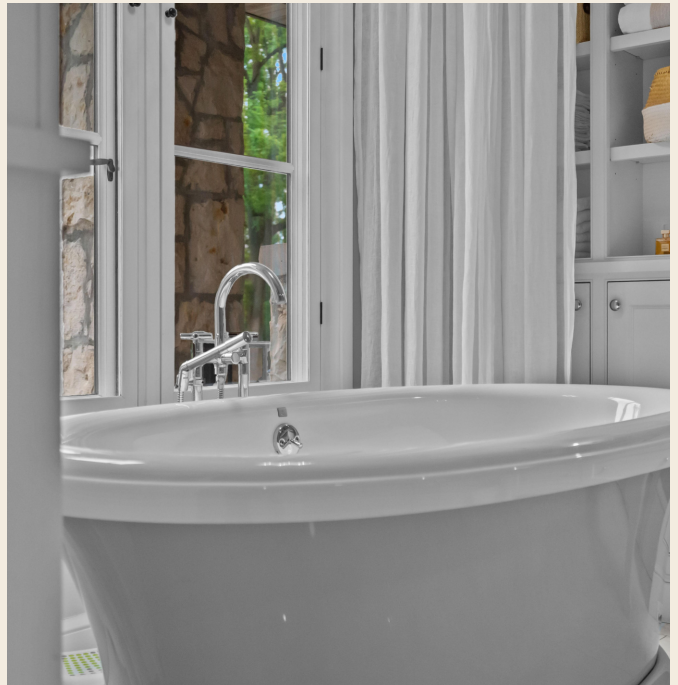
04 The primary ensuite.