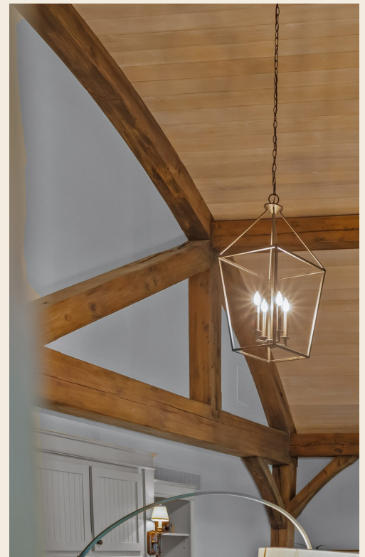
— Reclaimed beam detail.