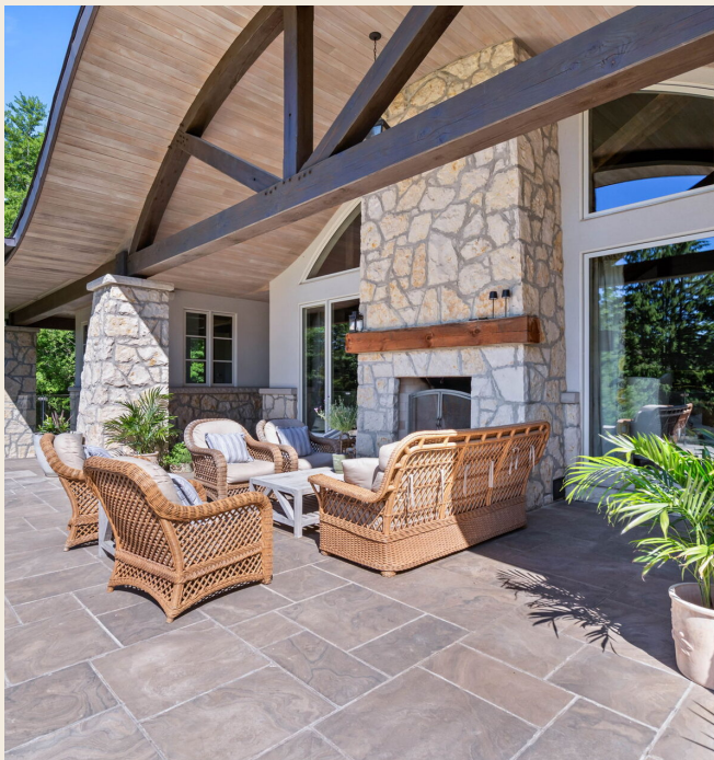
Fires on the covered terrace.