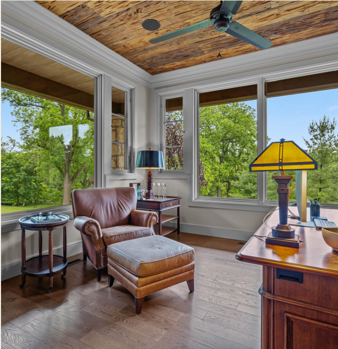
01 The office, amidst the trees.