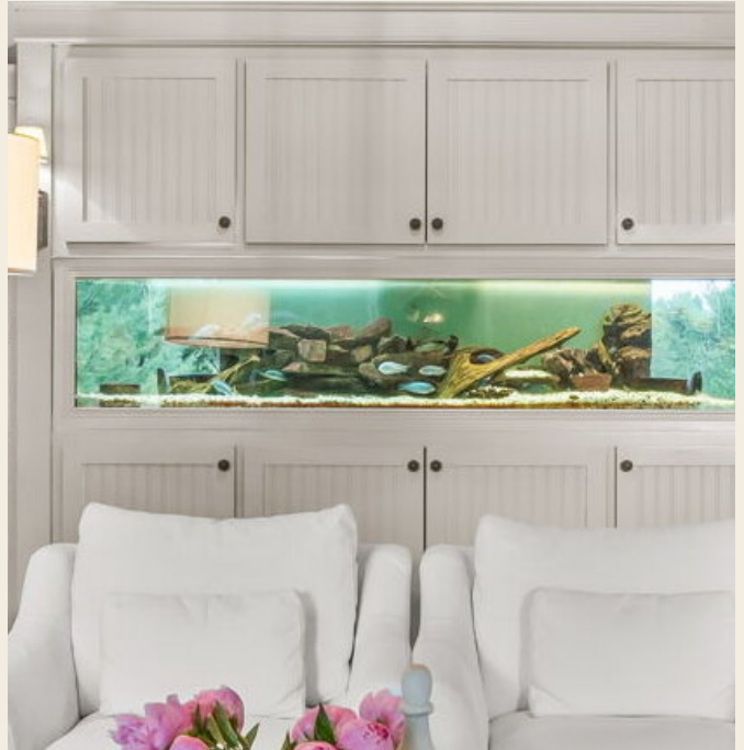
02 Eight-foot freshwater aquarium, built in.