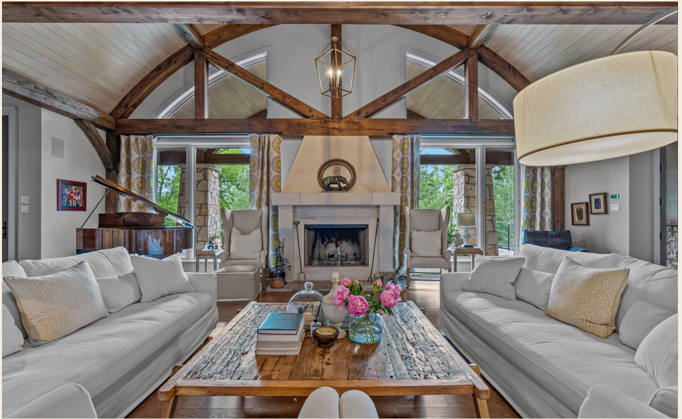
— The great room — gathering beneath the timber.