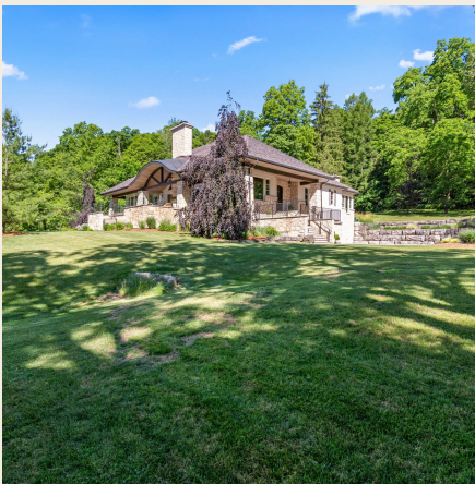
The house & lawn