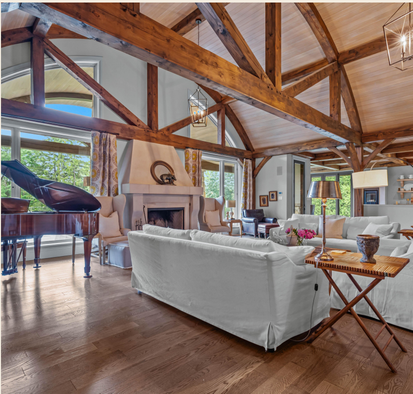
— Hand-built stone fireplace beneath the frame.

“A house quite literally made from its own land.”