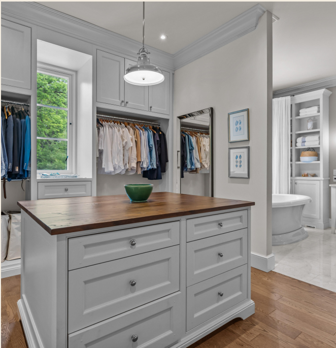
03 The walnut dressing room.