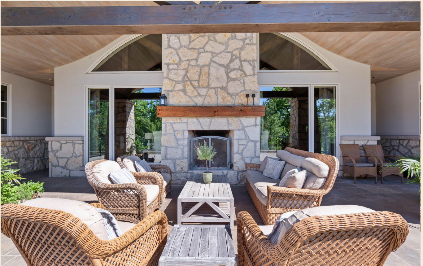
— The covered porch — stone columns, ash soffits, and the terrace fireplace.